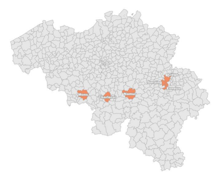
Figure 1: The cities/group of municipalities selected (Quehec, 2022)