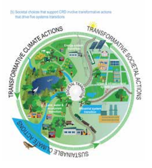
Figure 2.1 From fragmented to transformative climate actions.<sup>5</sup>